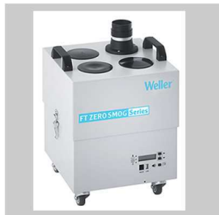
Solder fume extractors