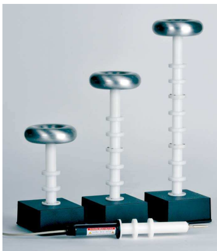
HVL Series High Performance Lab Grade, HV-SmartProbes™ shown above in 35KV, 70KV and 100KV models. Handheld HVP-35 portable HV-SmartProbes™ shown with detachable probe tip.

Vitrek's 4700 precisely measures voltages directly up to 10KV, right out of the box—with no external probes. That's high enough for most of the HV sources out there. However, should you care to expand your high voltage measurement range—just add one or more of the available 35KV, 70KV, 100KV and 150KV SmartProbes™. The Vitrek SmartProbes™ each store their own calibration data which is down loaded when they are plugged in to the 4700—this results in high accuracy, calibrated readings and allows any Vitrek SmartProbe™ to be used with any 4700 HV Meter. The SmartProbe's™ proprietary, ultra-low TC attenuator design minimizes self-heating—while its low capacitance technology enhances AC