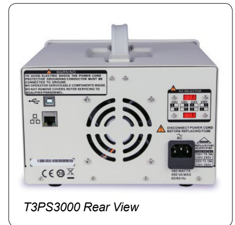
T3PS3000 Rear View