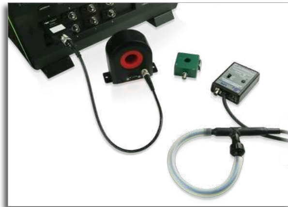
CA10 ProBus current adapter attached to a Danisense Current Transducer. Also shown is a Pearson Current Transformer and a PEM-UK Rogowski Coil, which are also third party devices that can be used with the CA10.

Local sales offices are located throughout the world. Visit our website to find the most convenient location.