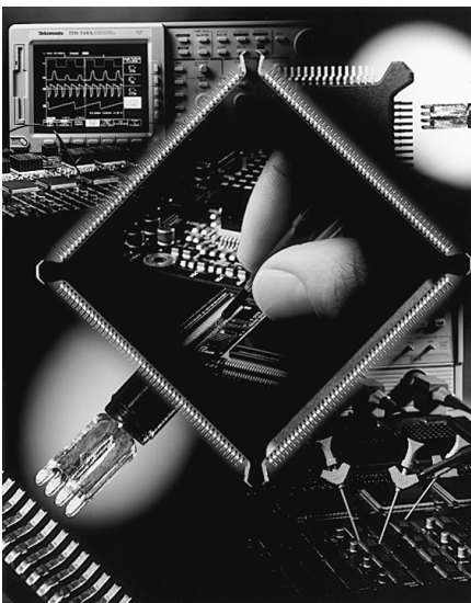
► SF500 Series (Surefoot)