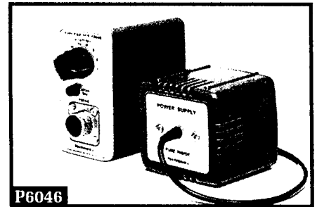
P6046 Amplifier with Power Supply.

A slip-on 10X attenuator is also included which increases the maximum input voltage from \pm 25 V to \pm 250 V and the common mode dynamic range from \pm 5 V to \pm 50 V.