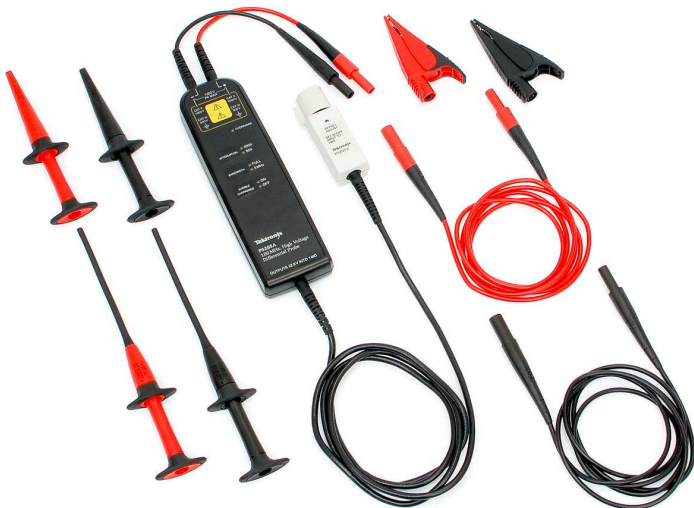
The P52xA Series probes provide high-voltage differential measurement solutions for any oscilloscope.

Probes and accessories are not covered by the oscilloscope warranty and Service Offerings. Refer to the datasheet of each probe and accessory model for its unique warranty and calibration terms.