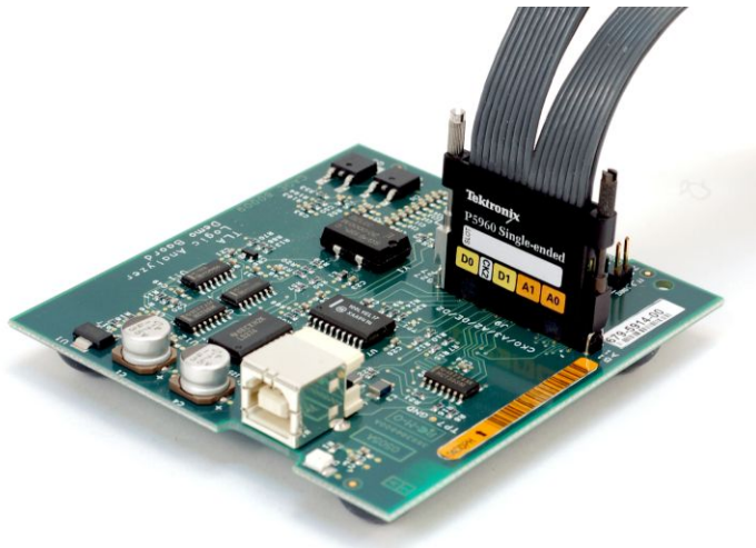
P5960 34-channel D-Max probe

For applications where circuit board space is limited, the 34-channel high-density P5960 D-Max offers the smallest available footprint and a quick connection mechanism.