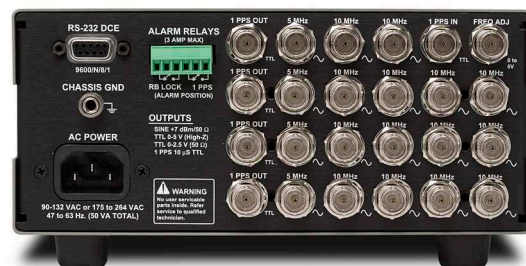
FS725 rear panel (with Opt. 03)