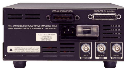
DS340 rear panel (w/ opt. 01)