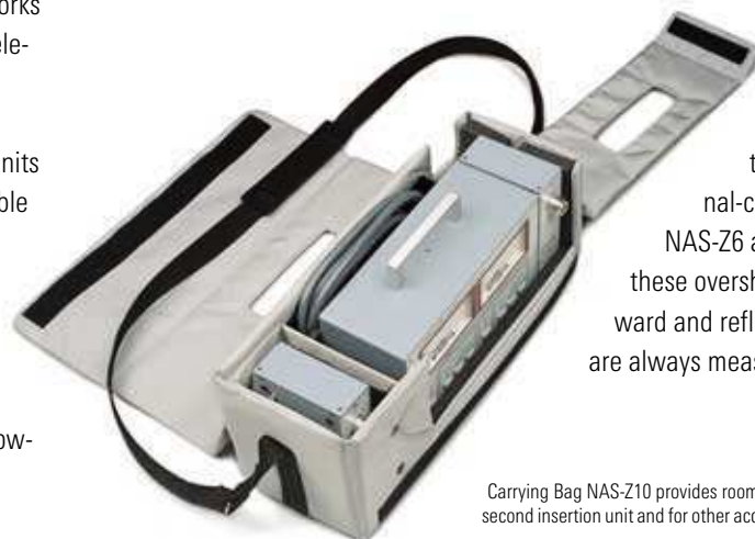
Carrying Bag NAS-Z10 provides room for a second insertion unit and for other accessories

The NAS may also be used for terminated power measurements. For measurements on transmitters, a termination acting as a dummy antenna is connected to the output of the insertion unit. Two models with a load-handling capacity of up to 10 (15) W or 30 (50) W are available.