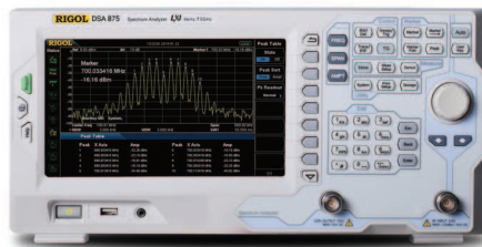
DSA Spectrum Analyzer