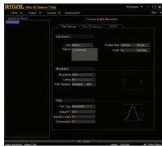
Ultra IQ Station