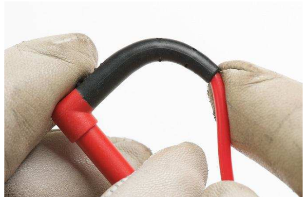
Extreme strain relief tested to withstand over 30,000 bends