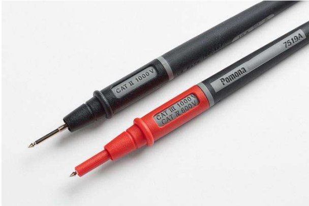
Probes always show the correct category rating for the tip exposure being used