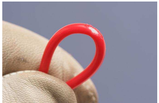
WearGuard™ indicator shows insulation damage

USA: Sales: 800-490-2361 Technical Support: technicalsupport@pomonatest.com Fax: 425-446-5844 Europe: 31-(0) 40 2675 150 International: 425-446-5500 Where to Buy: www.pomonaelectronics.com