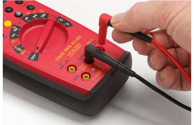
Universal plugs compatible with all 4mm shrouded inputs