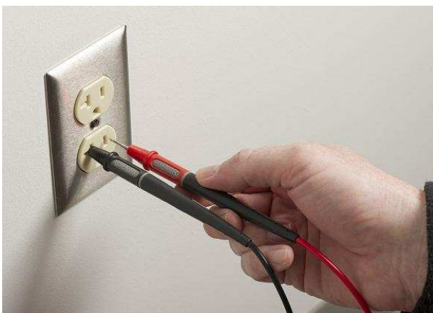
Increased tip exposure for CAT II probing