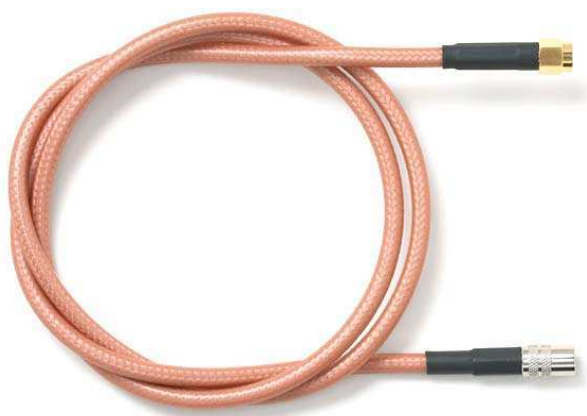
Model 73082 SMA Quick-Connect Plug to SMA Plug, RG142B/U

Small size, and durability for confident connections