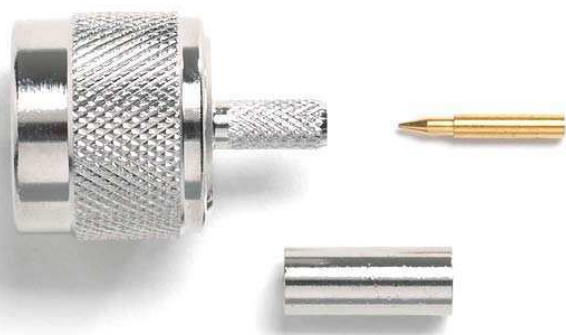
Model 73050 N Type Plug, 50 Ohm, Crimp Type, RG58, 141