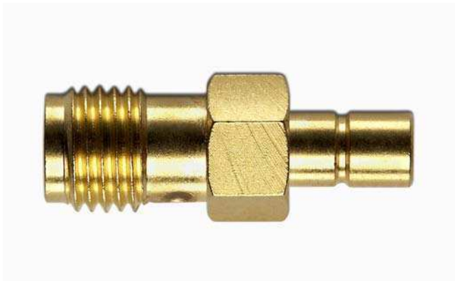
Model 72978 SMA (F) TO SMB (M)