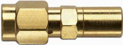
Model 72977 SMA (M) TO SMB (F)

High bandwidth, small size, and durability for confident connections.