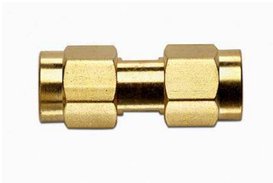
Model 72964 SMA PLUG (M) / PLUG (M)

High bandwidth, small size, and durability for confident connections.