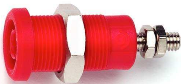
Model 72930 Panel Mount IEC 61010 4mm (0.16in) Jack for Sheathed Plugs