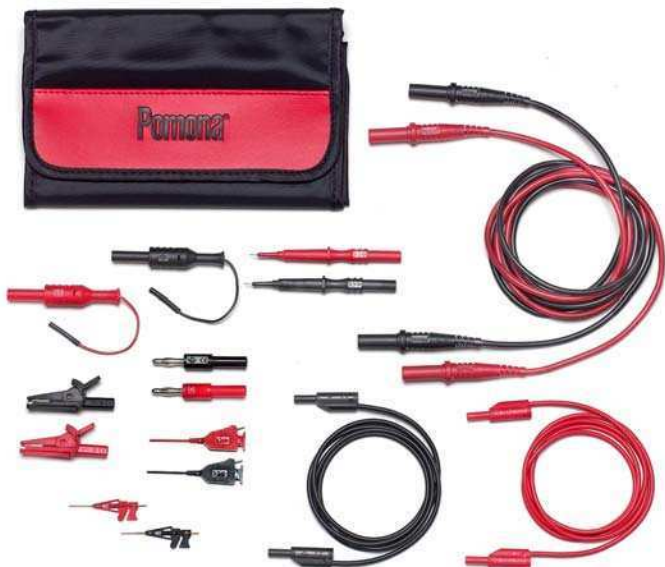
Model 72928 SMD Multi-Use Test Kit

Everything you need for SMD Test with your DMM in one kit