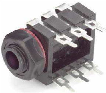
Model 7160 Horizontal 3-Conductor Jack, Solder Tabs