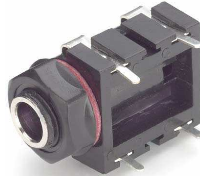
Model 7159 Horizontal 2-Conductor Jack, PC Board Mount