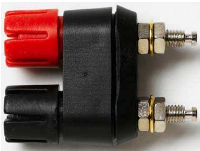
Model 6884 Dual Binding Posts with Raised Base