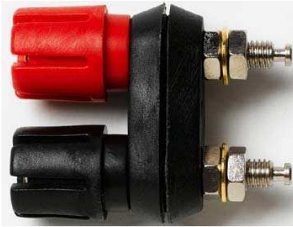
Model 6883 Dual Binding Posts