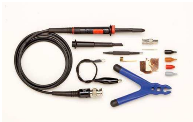
Model 6500 Modular Passive Oscilloscope Probe