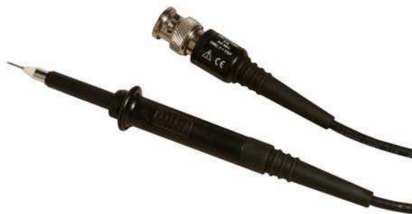
Model 6497 Modular Passive Oscilloscope Probe with Readout Actuator