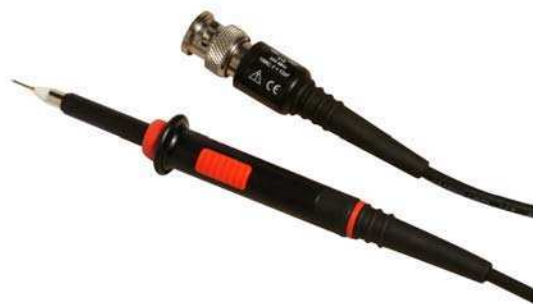
Model 6495 Modular Passive Oscilloscope Probe