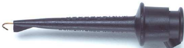
Model 4555 Do-It-Yourself Minigrabber Test Clip