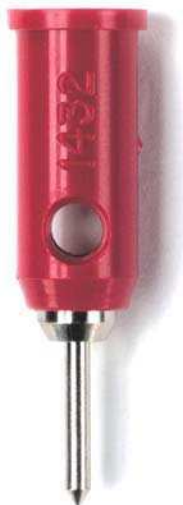
Model 1432 Banana Jack to Pin Tip Plug