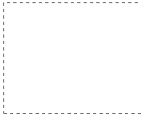
Figure 1. NI 9401 Input/Output Circuitry

The eight DIO channels are internally referenced to COM, so you can use any of the nine COM lines as a reference for the external signal.