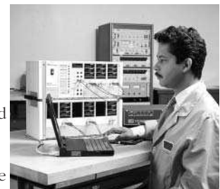
PULSAR performs computerized tests with IBM, or compatible PCs, even notebooks.

For high-current applications, PULSAR can be connected to the Multi-Amp EPOCH-20, and EPOCH-II, High-Current Output Units. The Multi-Amp High-Current Interface Module provides the control interface between PULSAR and the EPOCH-20 or EPOCH-II to provide high-current, high-volt/ampere output for single-, three- or six-phase testing. For specifications on the Interface Module, the EPOCH-20 and EPOCH-II, refer to catalog entries for these models.