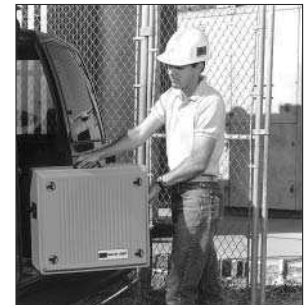
One technician can easily carry PULSAR.