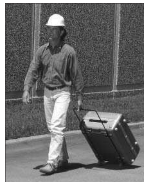
The laboratory-style unit comes with a retracting-wheel carrying case for easy transport.

FOR ORDERING INFORMATION, REFER TO PAGES 14-15.