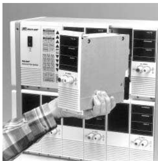
Modules slide out easily so you can configure the system to meet your applications.

The system is customized by adding a timer module and the number of current and voltage amplifier modules needed for specific testing applications.