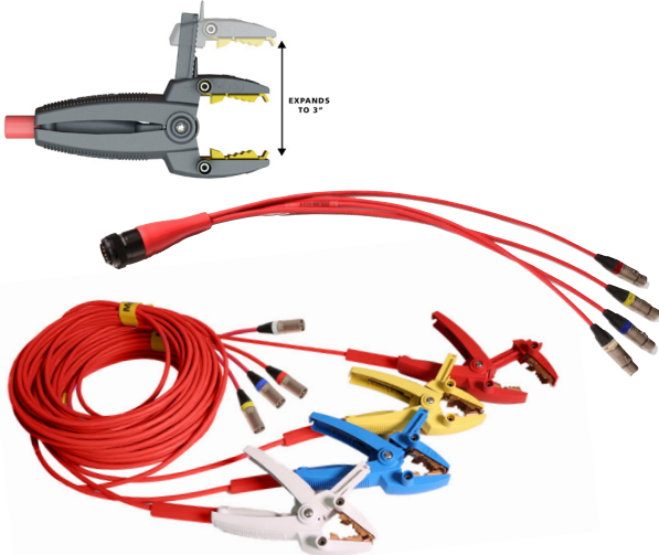
Available in 9 m (30 ft), 18 m (60 ft) and 30 m (100 ft) lengths

Newly designed test leads, shown in image below, are universal and can be used for winding resistance (MTO3XX) or turns ratio (TTR3XX) instruments. Expandable jaws, shown in inset, allow for testing any size transformer.