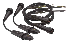
+ DH4-C probe 1.5 m leads