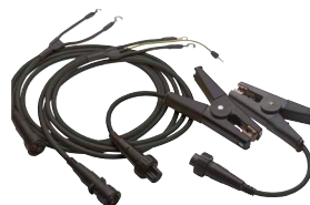
+ KC1 Kelvin clip 3 m leads