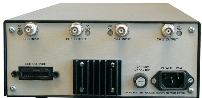
3940 Rear Panel View

Specifications subject to change without notice.