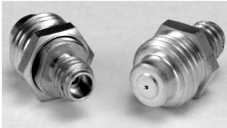
A pair of 1.0 mm female connector launch assemblies. Left: 1.0 mm female connector end Right: Package end with 0.162 mm diameter pin