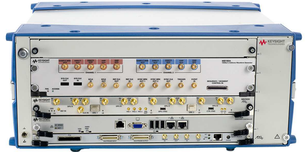
Figure 3. M8190A arbitrary waveform generator, M9703A digitizer in a M9505A 5-slot AXle chassis.

An augmented local bus, providing communication and synchronization between slots, facilitates complex multi-instrument configurations, data storage and co-processing. As a result, AXle instruments provide timing, triggering, and module-to-module data movement features for high-performance test and measurement systems used in aerospace defense, high-energy physics, semiconductor test and other industries.