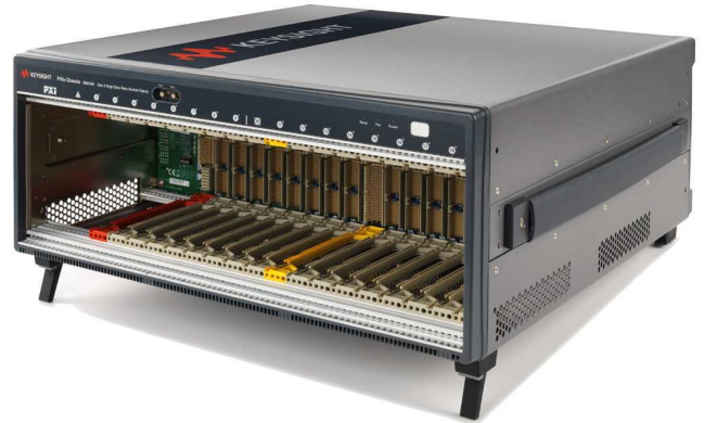
Figure 2. Keysight's M9019A PXIe 18-slot chassis, Gen 3

For a complete list of PXI instruments, visit: www.keysight.com/find/PXI