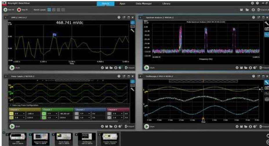
Figure 1. See your measurements across instruments in one place to quickly correlate measurement activities and obtain actionable insights.

With the companion BenchVue Mobile app, monitor and respond to long-running tests from anywhere. Download BenchVue software at no cost today www.keysight.com/find/benchvue