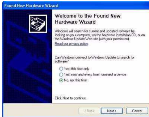
Figure 7: Found New Hardware Wizard dialog box