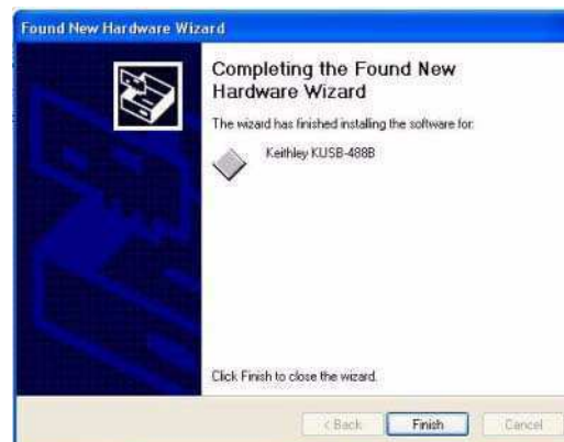
Figure 9: Completing KUSB-488B software installation