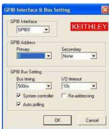
Figure 12: GPIB interface and bus configuration