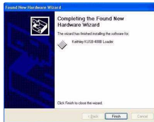
Figure 6: Completing KUSB-488B Loader software installation