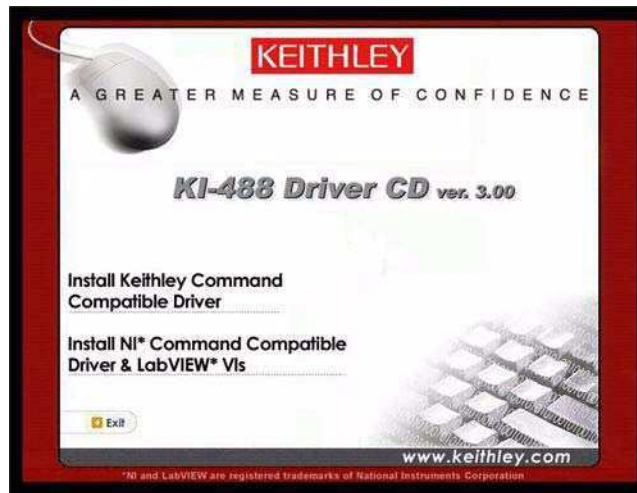
Figure 2: KI-488 Driver CD installation screen