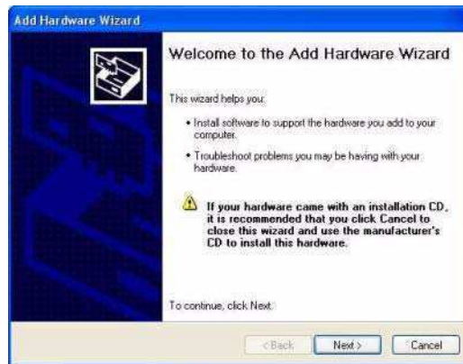
Figure 10: Add Hardware Wizard dialog box