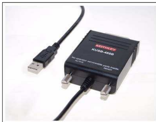
Figure 1: KUSB-488B USB to GPIB Converter