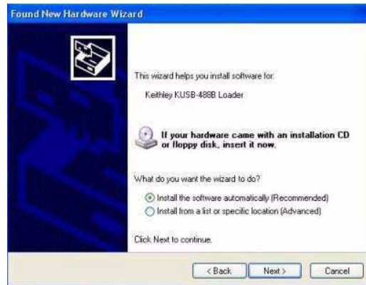
Figure 5: Select automatic installation of KUSB-488B Loader software