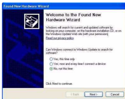
Figure 4: Found New Hardware Wizard dialog box