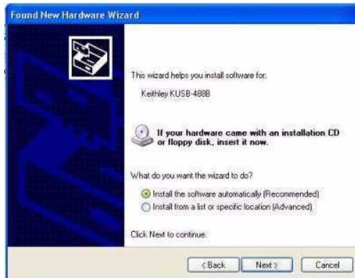
Figure 8: Select automatic installation of KUSB-488B software