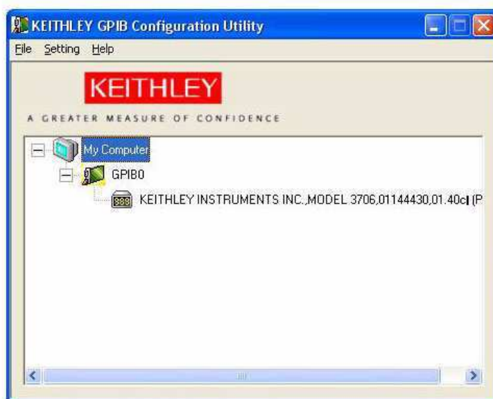
Figure 11: Keithley GPIB Configuration Utility