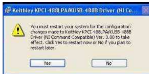
Figure 3: Restart system