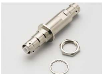
Figure 1: Model HV-CS-1613

The Model HV-CS-1613 is a high-voltage triaxial panel-mount feedthrough connector. You can use it with any customized test fixture or panel.