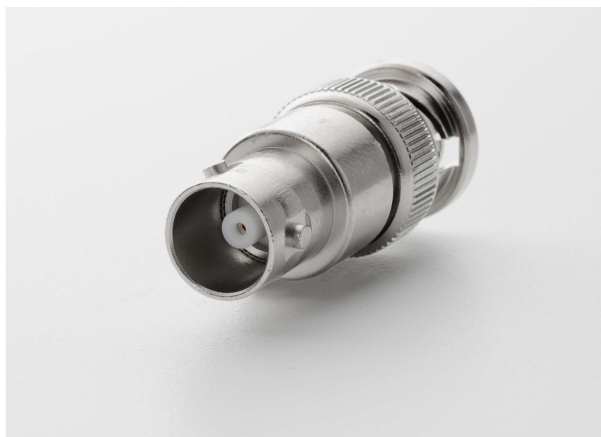
Figure 1: Model 237-BNC-TRX

The BNC end of the Model 237-BNC-TRX High-Voltage 2-Slot BNC to 3-Lug Female Triaxial Adapter will mate directly to an instrument that uses BNC connectors. The other end of the adapter will accommodate a 3-slot triaxial cable to allow connection to equipment that uses 3-lug triaxial connectors.