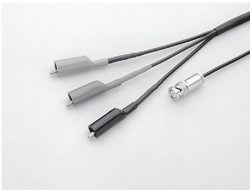
Figure 1: Model 237-ALG-2

The Keithley Instruments Model 237-ALG-2 is a 6.6 ft (2 m) triaxial cable that is terminated with a three-slot male triaxial connector on one end and alligator clips on the other end.