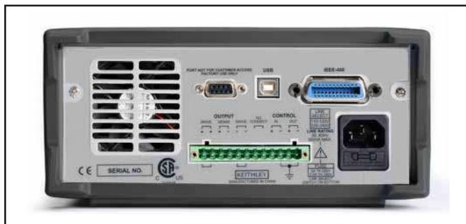
Series 2200 rear panel.

1.888.KEITHLEY (U.S. only) www.keithley.com