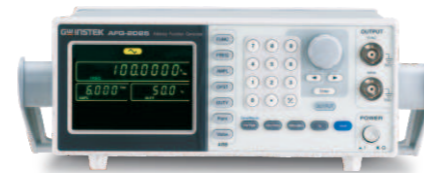
AFG-2000 Series Front