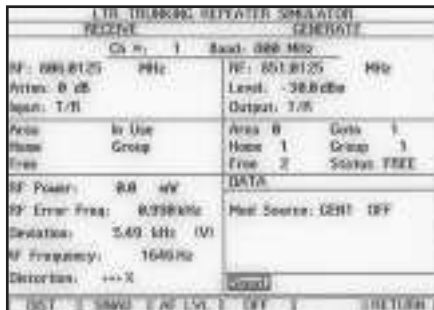
Clear Channel LTR Menu

The CLEARCHANNEL LTR™ trunking option allows the COM-120B to be configured to simulate LTR repeater systems. The test set can perform system encode/decode functions as well as Home and Next repeater access procedures.