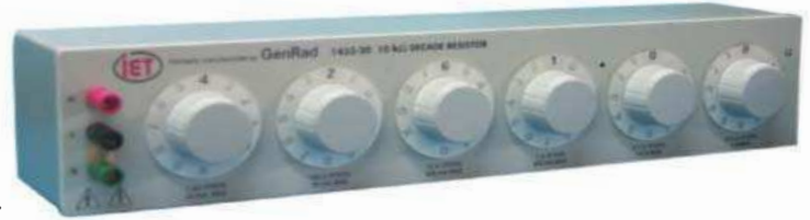
Model 1433 Precision Decade Resistor

The 1433 Decade Resistors are primarily intended for precision measurement applications where their excellent accuracy, stability, and low zero resistance are important. They are convenient resistance standards for checking the accuracy of resistance measuring devices and are used as components in dc and audio frequency impedance bridges. Many of the models can be used into the radio-frequency range.