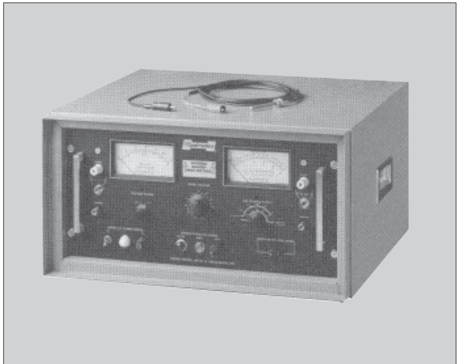
Model H306B Hipot Tester