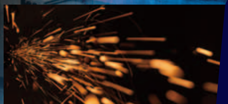
Arcing and sparks