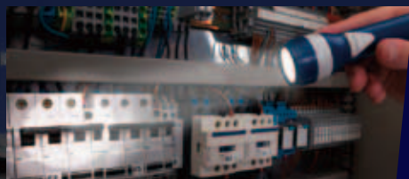
Erroneous circuit-breaker activation

Even if you mistakenly measure voltage using the resistance range