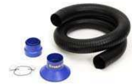
C1572 Duct Kit