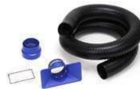
C1571 Duct Kit