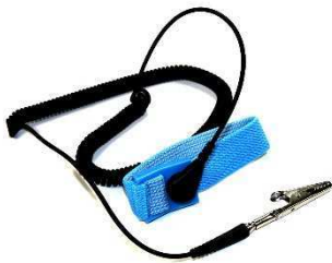
CHP SC-0807 wrist strap