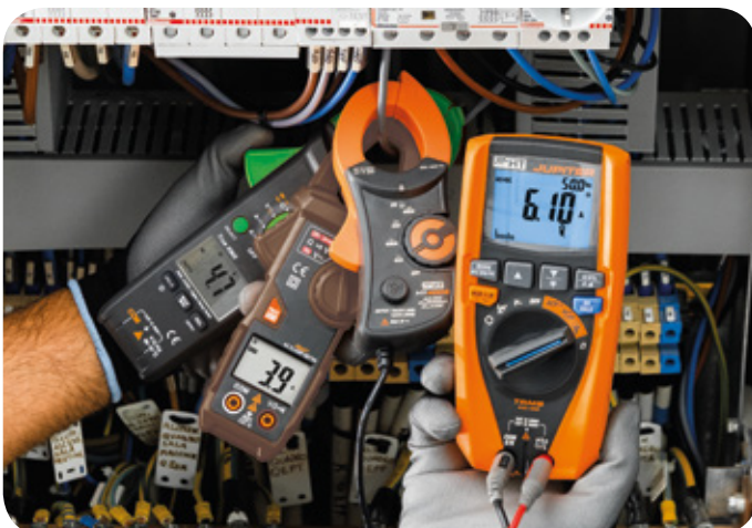
Measurement comparison: 3.9A: with RMS clamp - 4.7A: with TRMS clamp 6.1A: correct reading with AC+DC TRMS clamp.