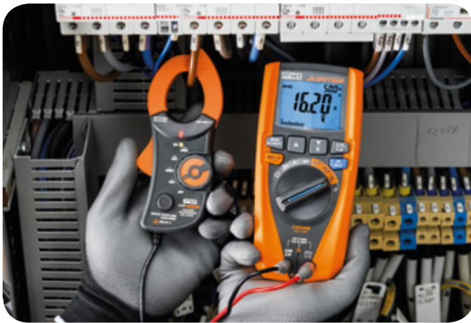
TRMS AC+DC current measurement.