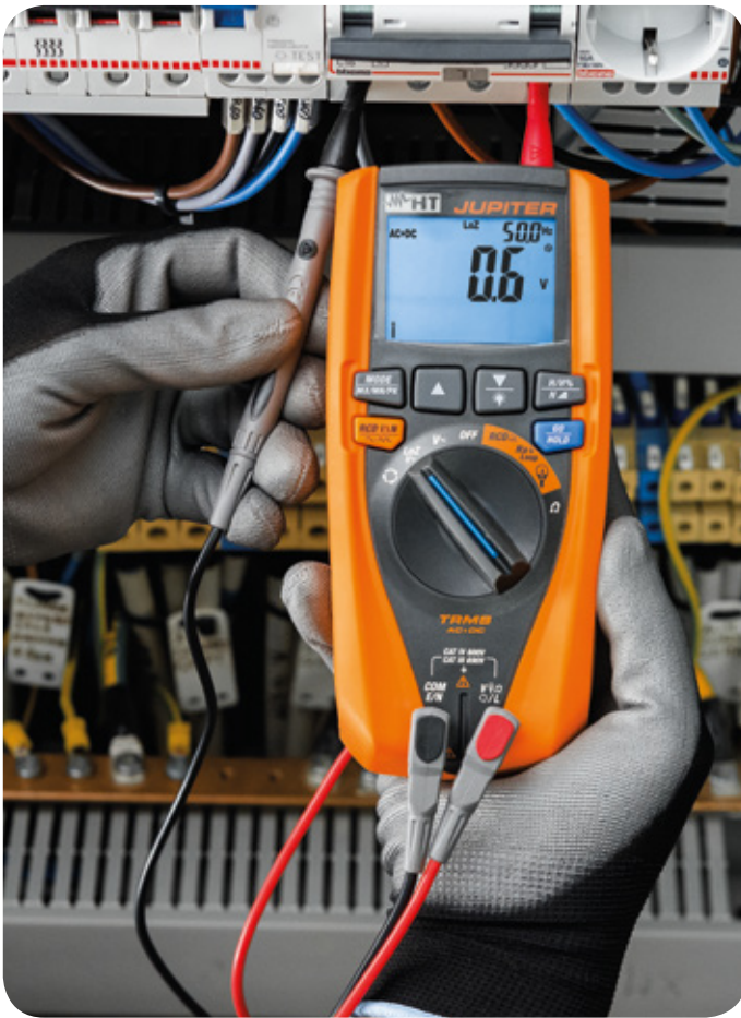
Ghost voltage cancellation.