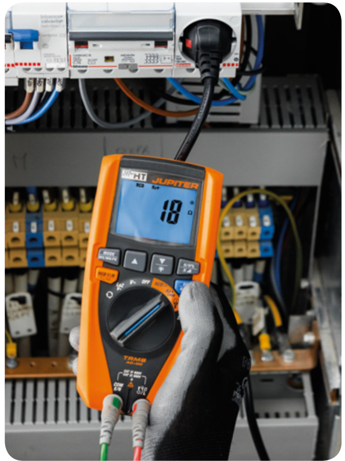
Non-trip earth ground resistance measurement.