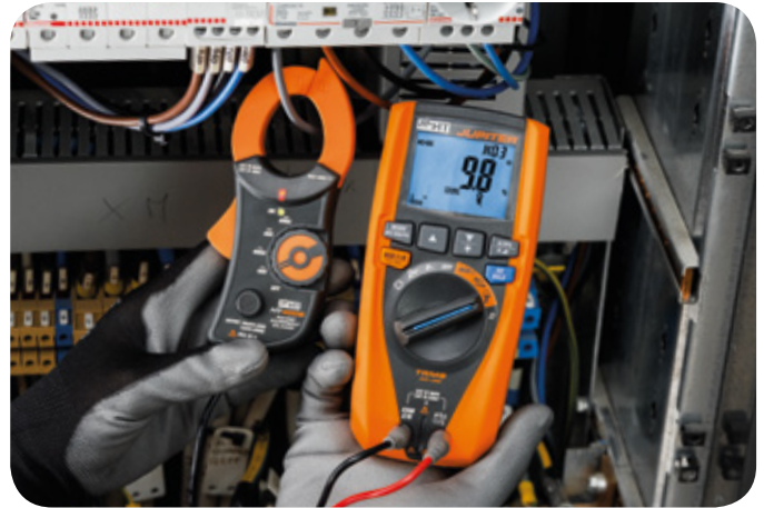
Current harmonic measurement.