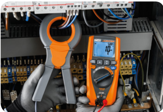
Leakage current measurement.