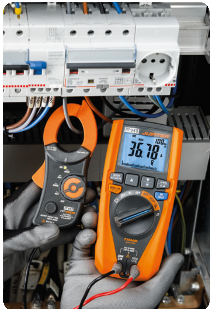
Inrush Current measurement.