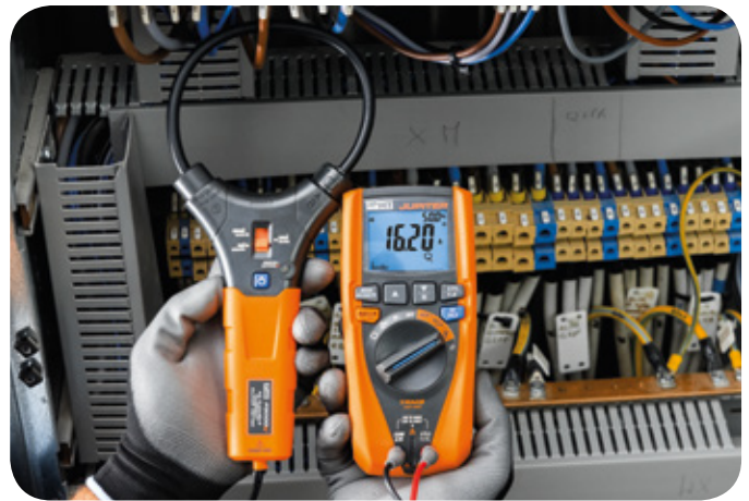
AC current measurement with flexible transducer F3000U.