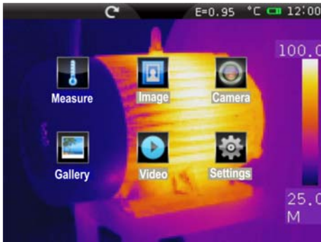
General menu with icons

The THT60 model is a advanced infrared camera with capacitive touch-screen TFT color display for quick and intuitive advanced use from any kind of thermograph operator