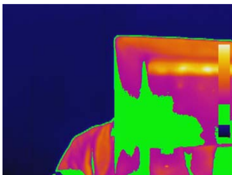
Advanced analysis: Isotherm feature