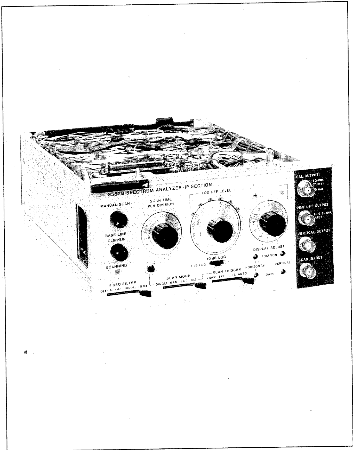
Figure 1-1. Model 8552B Spectrum Analyzer IF Section