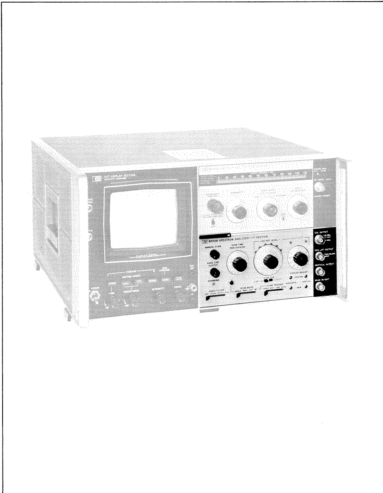
Figure 2-1. Model 8552B Spectrum Analyzer IF Section with 8553B RF Section and 141T Display Section